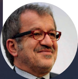
PRESIDENT OF THE LOMBARDY REGION

Working together, we can contribute to the new industrial renaissance of Europe, strengthening the resilience of our societies to the current and future challenges.